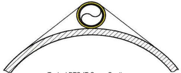
Typical BTS-IT Cross Section (Tracer attached to pipe with FT-1H tape)